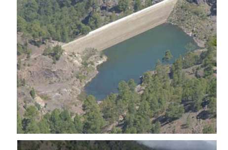
Photo1. Horizontal precipitation brings a great quantity of water resources to the Canaries.

Photo 2. Water is a powerful factor affecting the agriculture of theislands.