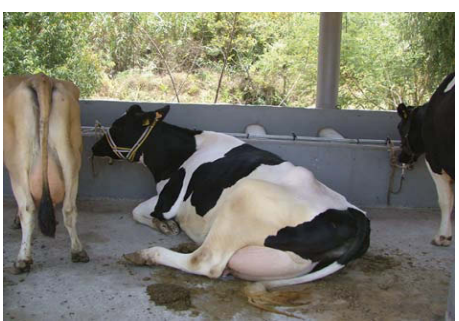
Photos 4,5 and 6. Livestock in the Canary Islands has traditionally been complementary to agriculture. The main types of most frequent livestock are, in this order: goats, pigs, cows and sheep. There are also many hens, rabbits and beebives