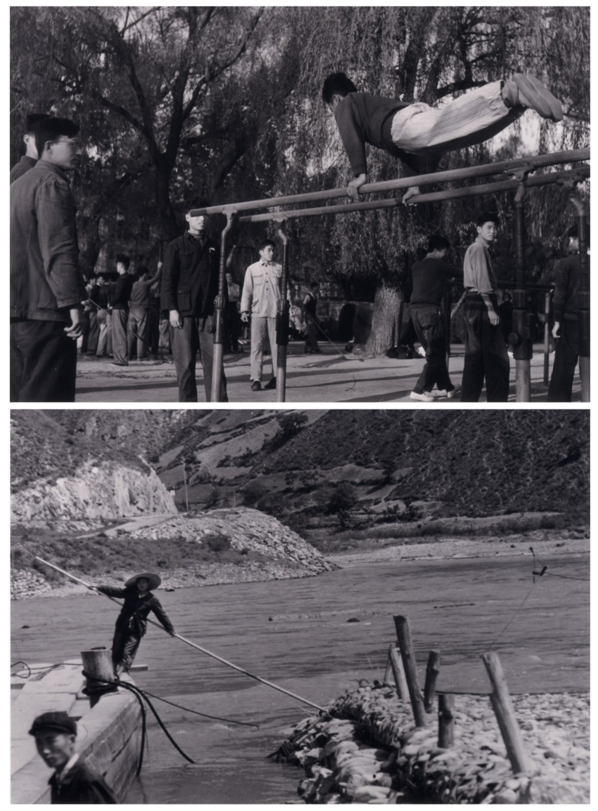
Figures 5 and 6—Eva Landau. China , 1954. Gelatin silver print. Courtesy of Christine Dufour-Beöthy