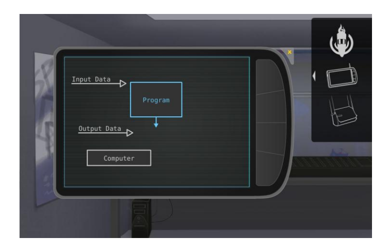
Figure 2 – Solving the first puzzle.

Figure 2 represents the game interface for the first puzzle to be solved. Loose pieces of a diagram are scattered across the PDA's screen and it is necessary to rearrange them to represent the model of the computer as a programmable data processor (Forouzan, 2003). Also represented in Figure 2 is the slide menu -on the right side of the screen-, where the student-player can request a hint from the robot, consult the PDA or check the inventory. As shown in Figure 3, when the puzzle is complete, the robot will provide a wider explanation about the model, and the student-player will be able to proceed to the next task.