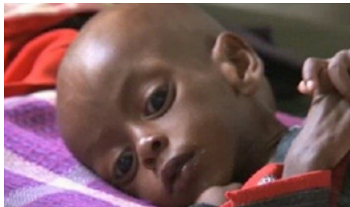
Fig. 3 - Representation of a suffering African child

At the same time, visually the viewer is placed in an “empowered” position. As the camera presents African people from high angle the audience is vested with the feeling of control. The impression is created that the powerless are waiting for help from those who have the power to grant it. Their anticipation, which is full of hope, is also connoted by their frontal position and gaze directed straight at the camera (Fig. 3, 4).