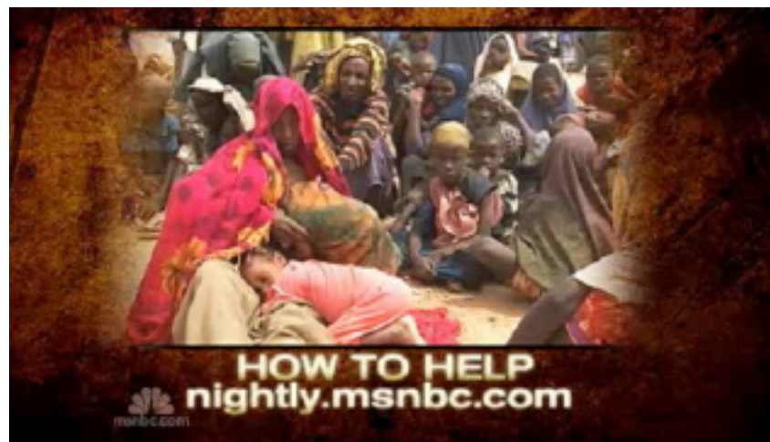
Fig. 5 - Empowering/instructing the audience to help

13) And we know a lot of our generous viewers will want to help the people in the Horn of Africa. There is a list of charities who are doing just that on our website.