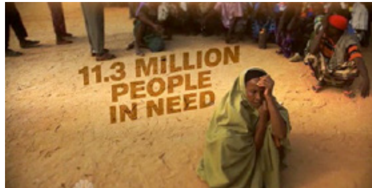
Fig. 4 - Representation of Africans in need

The audience is thus empowered to help, and the knowledge of this fact is also attributed to the news anchor, confirming his authority and omnipotence: