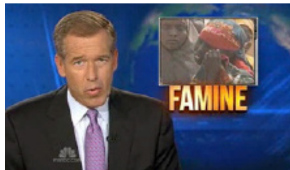
Fig. 2 - The (re)presentation of the news anchor person (NBC news)